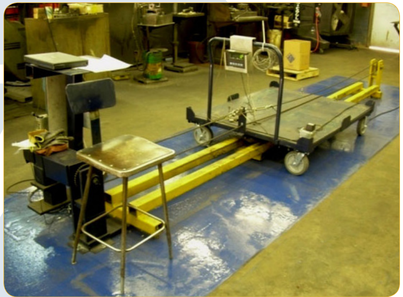
Figure 1: RWM Automated Push/Pull Test Machine

The RWM Automated Push/Pull Test Machine allows RWM Engineering and Quality Assurance staff to determine the amount of force required to push or pull a loaded cart equipped with a particular set of four casters. The machine uses a test cart that straddles a set of guide rails (to keep the cart from wandering left or right) and is pulled by a circuit of chain that is driven by a variable speed electric motor. At the point where