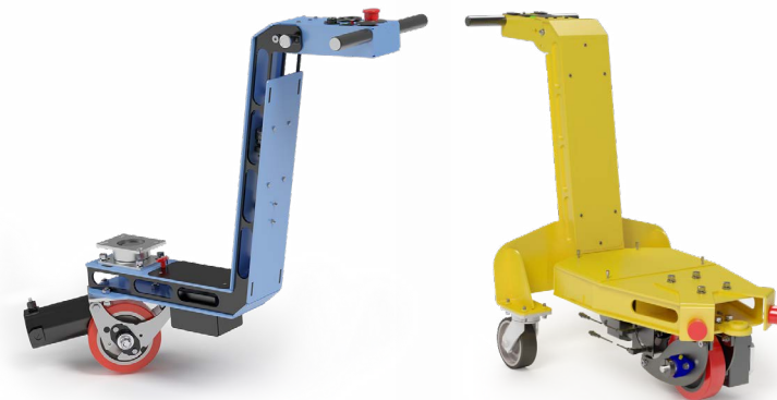
CONVERSION DRIVE CASTER