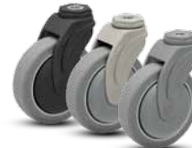
Custom Colors Available