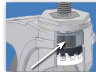
316S stainless steel precision sealed ball bearing raceway design for smooth, quiet maintenance free ride.

Nylon and 316S stainless steel construction allows these casters to have a reduced magnetism.