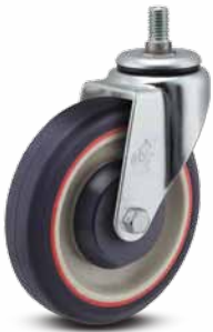
Standard Zinc plated