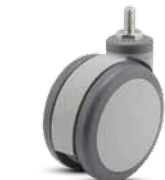
Antistatic available, see page 102-103.

Special colors available. Consult factory.