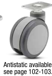
Antistatic available, see page 102-103.

Special colors available. Consult factory.