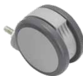
Undercover shield for ultimate protection.

Special colors available. Consult factory.