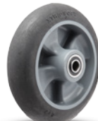
8" diameter model