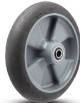
10" diameter model